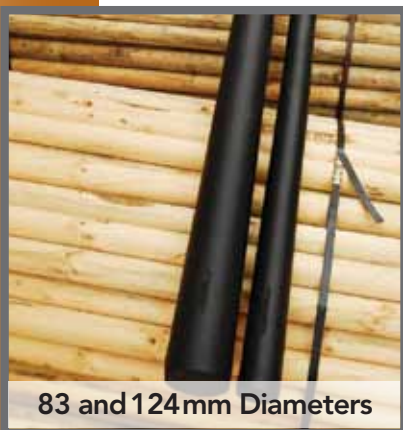
83 and 124mm Diameters

WoodShield timber posts feature a simple yet revolutionary protection system completely free of chemicals. The production process coats a machined pine timber pole in a protective layer of plastic up to 6mm thick, encasing the post to a finished size of 83mm standard post, or 124mm for row-end posts. Rectangle fencing rails are produced in the same way.