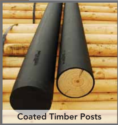
Coated Timber Posts

WoodShield timber fencing posts and rails have superior strength and rigidity combined with the protective properties, toughness and lifespan of polyethylene.