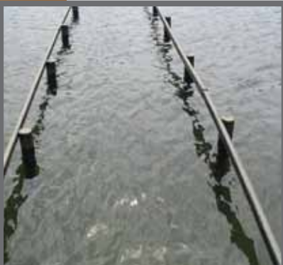
Aquaculture Post and Railing

We receive excellent feedback from Growers and Contractors.