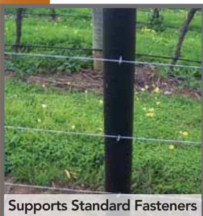
Supports Standard Fasteners

The process creates a strong adhesive bond between the timber and plastic sheath leaving no exposed timber and completely sealing the post. The post ends are protected with very thick end caps which enable them to be hydraulically "whacked" into the ground exactly as a standard timber post would.