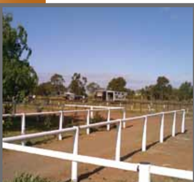
Available in White