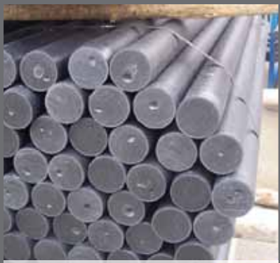
Sealed to climatic conditions

WoodShield has addressed the many issues of chemically treated posts; splitting, chemical leaching, rotting and breaking at ground level to name a few. WoodShield offers a chemical free long life timber post with little to no degradation over time, a real alternative to CCA posts.